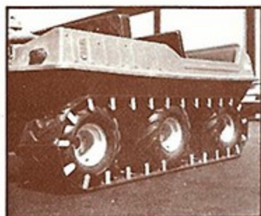
Snow Track (II & IV)