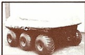
Transport Cover (II & IV)