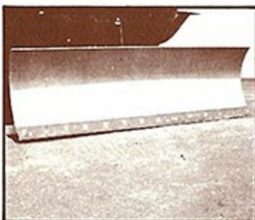
Snow Plow (II & IV)