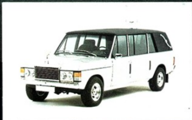
The Regal aspect