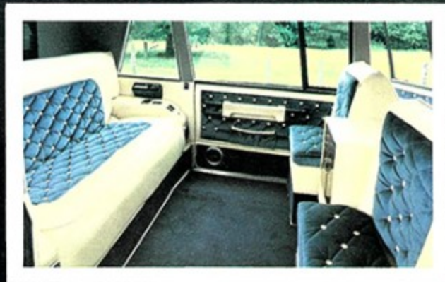
The pinnacle of opulence

In its drop-head form the Rapport EXCELSIOR is a superlative state limousine. Dignified lines, a wide range of coach finishes and other refinements will crown any prestigious occasion.