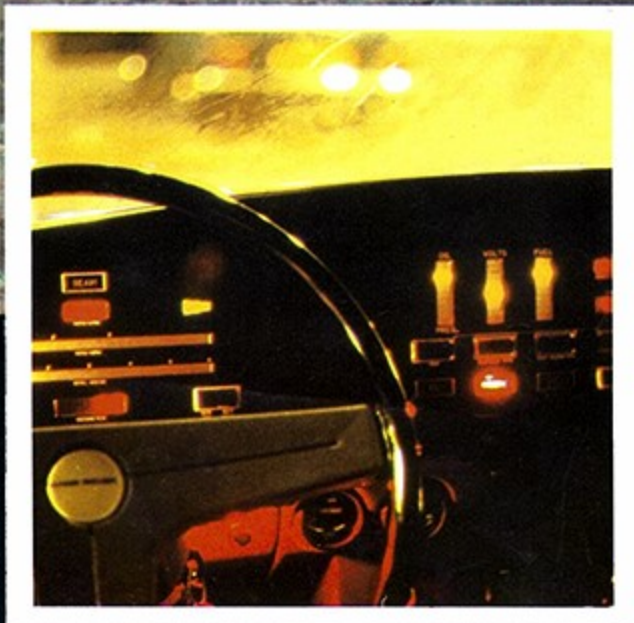
Advanced technology digital dashboard