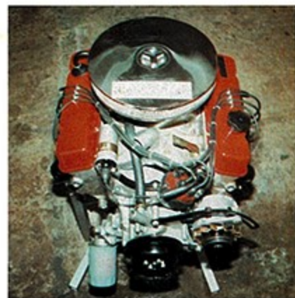
Powerful 4.4 litre Leyland engine