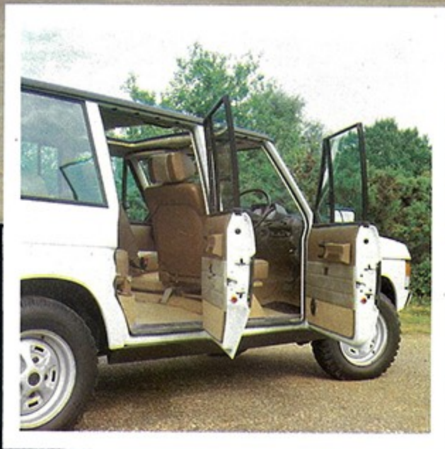
Convenience through accessibility