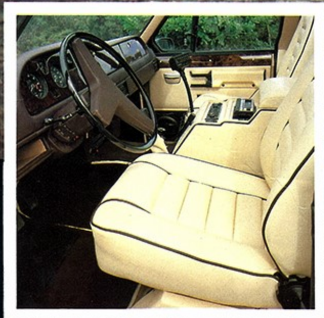
Handcrafted walnut fascia and central electronics module