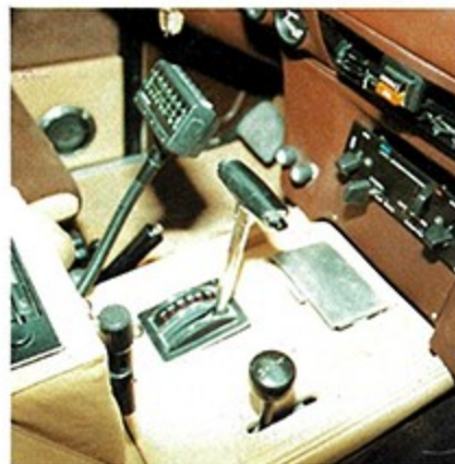
Effortless automatic transmission