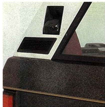
Double-capacity fuel tank