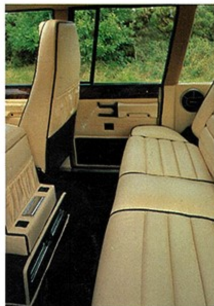
Neatly fashioned rear air conditioning