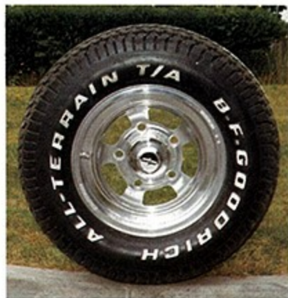
Sports wheel and tyre